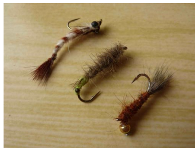
Anglers' wet flies.

The AMI scheme is an ‘assemblage’ of values and facts, ambitions and agency. It bridges a gap between an instinct to act, and the facts and laws with which to act. Watercourses are protected through pragmatic collaboration and dialogue between angler-sentinels, EA officers and scientists, creating a public and corporate awareness of ‘cause and effect’. The workshop is a robust component of such an impact but for a fuller picture it is now necessary to look at other AMI features.