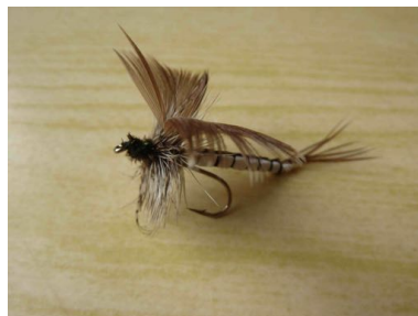
Anglers' dry fly.

At the end of twentieth century, the aims and values of UK anglers and Government were now aligned. Aided by science, and NGO interest, an alliance of institutions and citizen agents, was ready to produce “powerful matrix management efforts” Cooper et al. (2007). The next chapter looks at the AMI’s formation and its social make-up meeting this potential.