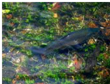
Trout on the River Test.

This final chapter has proposed theoretical perspectives that can assist in conceptualising the AMI and its activities. Combining observation, interviews and theoretical literature may be thought to muddy the waters. Yet literature addressing science-public relations exhibits a multi-perspective approach, indicating an interdisciplinary interest in supporting external and internal reflection aiming geared towards an environmentally beneficial institutional praxis. It is now necessary to draw the study’s findings together with some final thoughts.