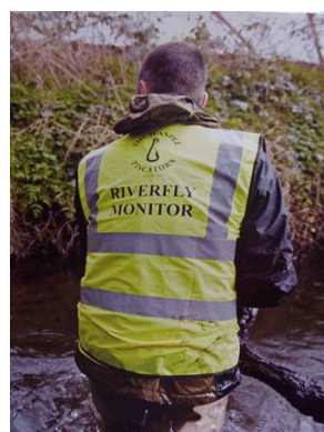
AMI volunteer on the River Wandle © Wandle Piscators, 2012.

Arguably we might see social agents like Brooks and Pike working towards a sustainable, resilient “socio-ecosystem”: a science-society assemblage that can survive external pressures and local disturbances. Through their efforts, might the AMI continue to be a building block for human engagement with the natural world that Ellis & Waterton had discussed back in 2004? The AMI may not be the site of disinterested activity, but it an influential locus of respected standards and ambition. It survives as an example of the possible . It is both normative and pragmatic, overseeing dialogue between groupings and offers a viable, flexible practice at the water’s edge. The AMI offers a citizen’s science that citizen environmentalists of whatever persuasion are still willing and very able to understand and adopt.